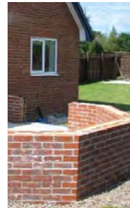
Dwarf wall built