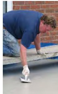
Base is levelled