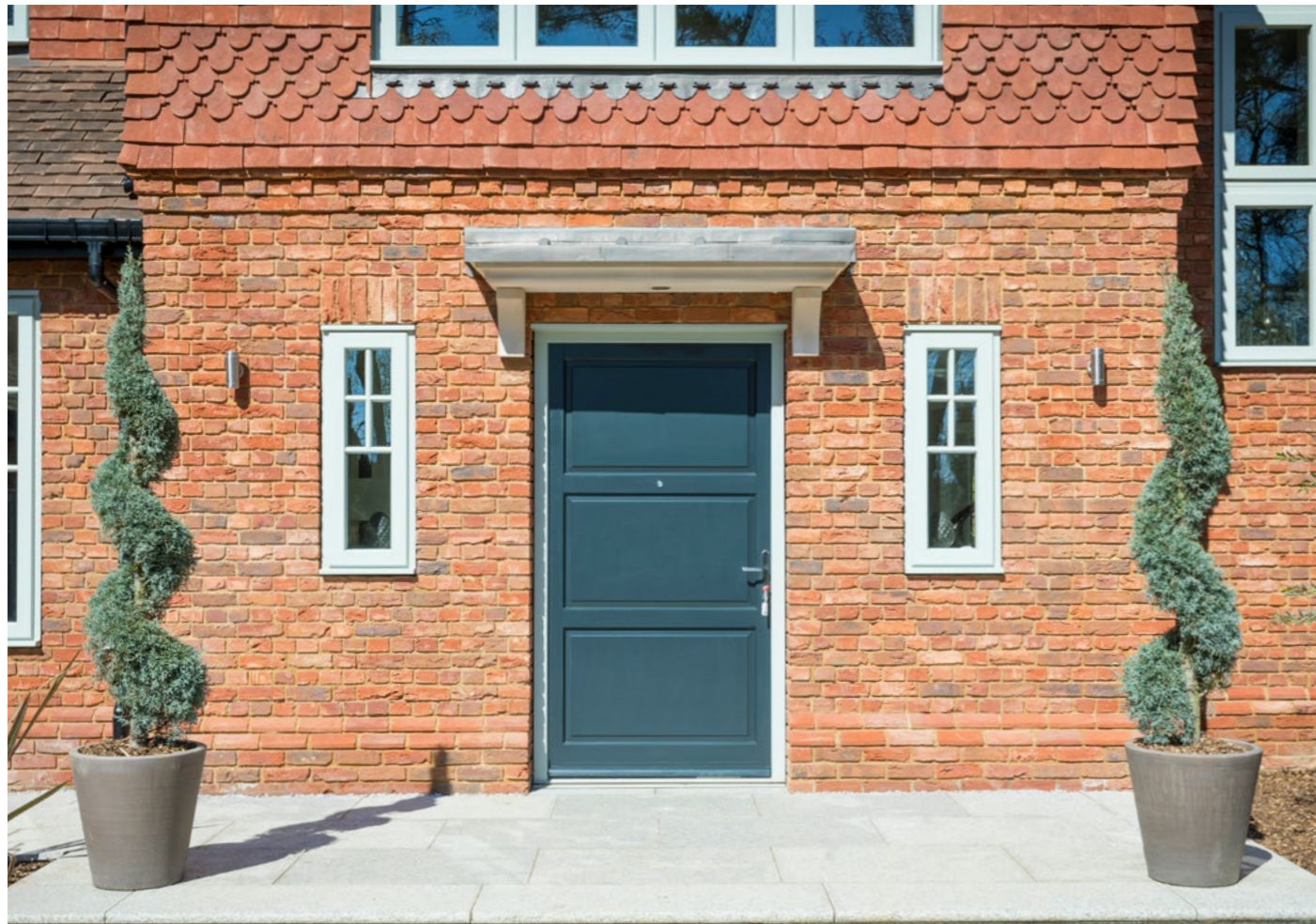
Lipped Casements Farrow & Ball Colour Match No. 22 Light Blue