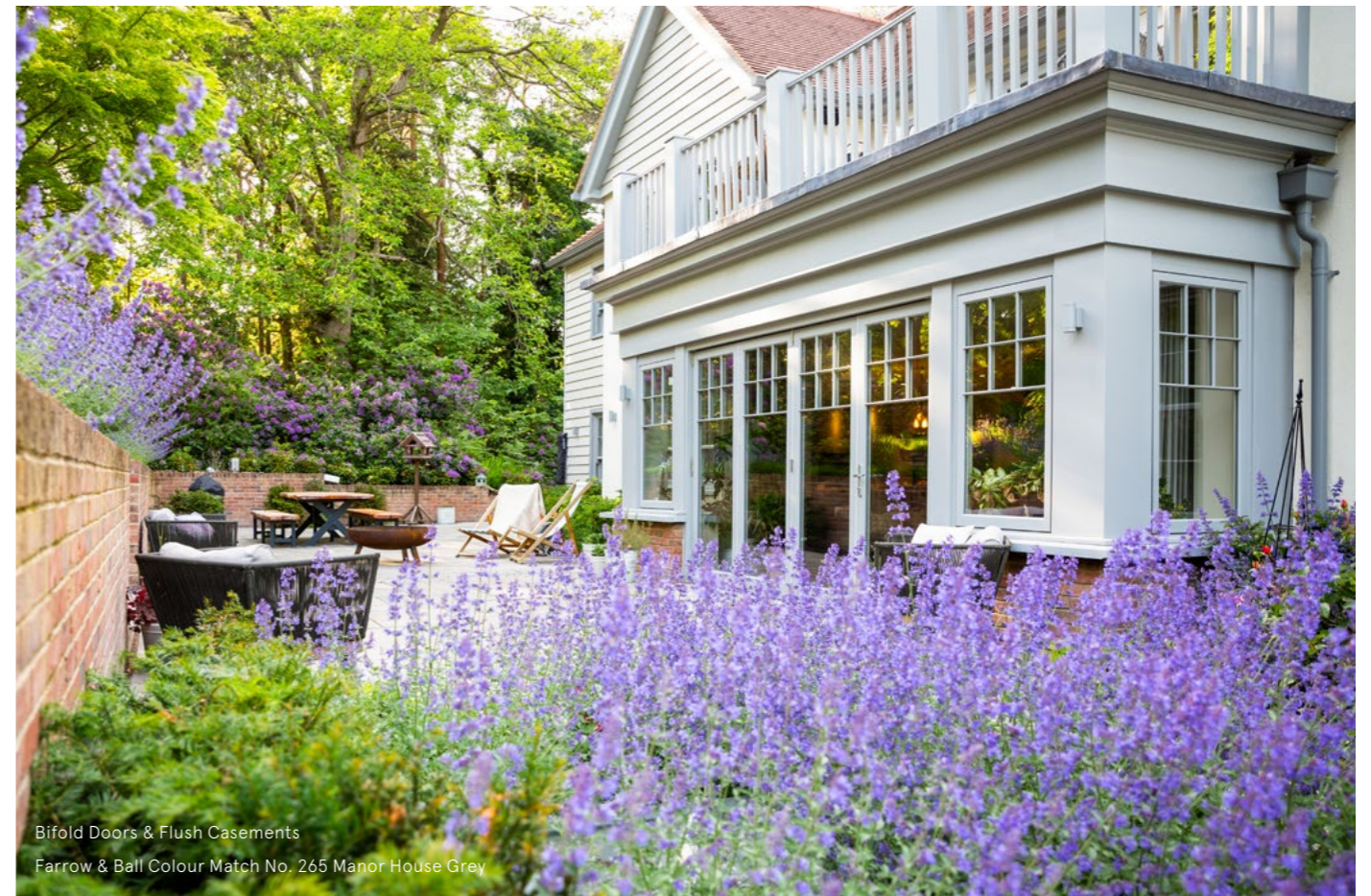
Bifold Doors & Flush Casements Farrow & Ball Colour Match No. 265 Manor House Grey