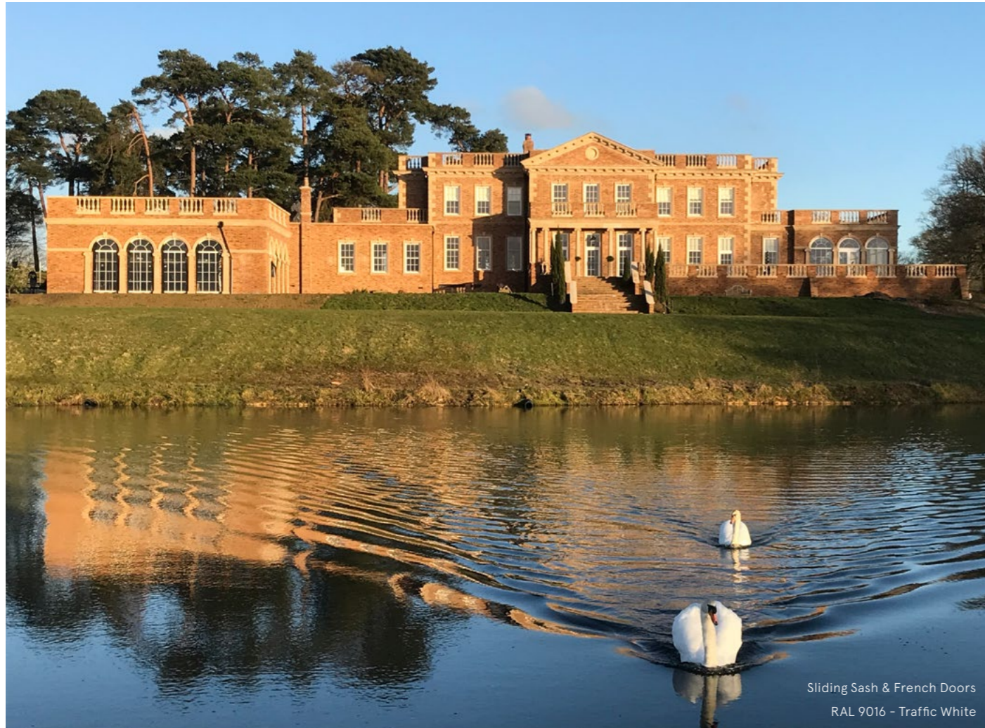
Sliding Sash & French Doors RAL 9016 - Traffic White