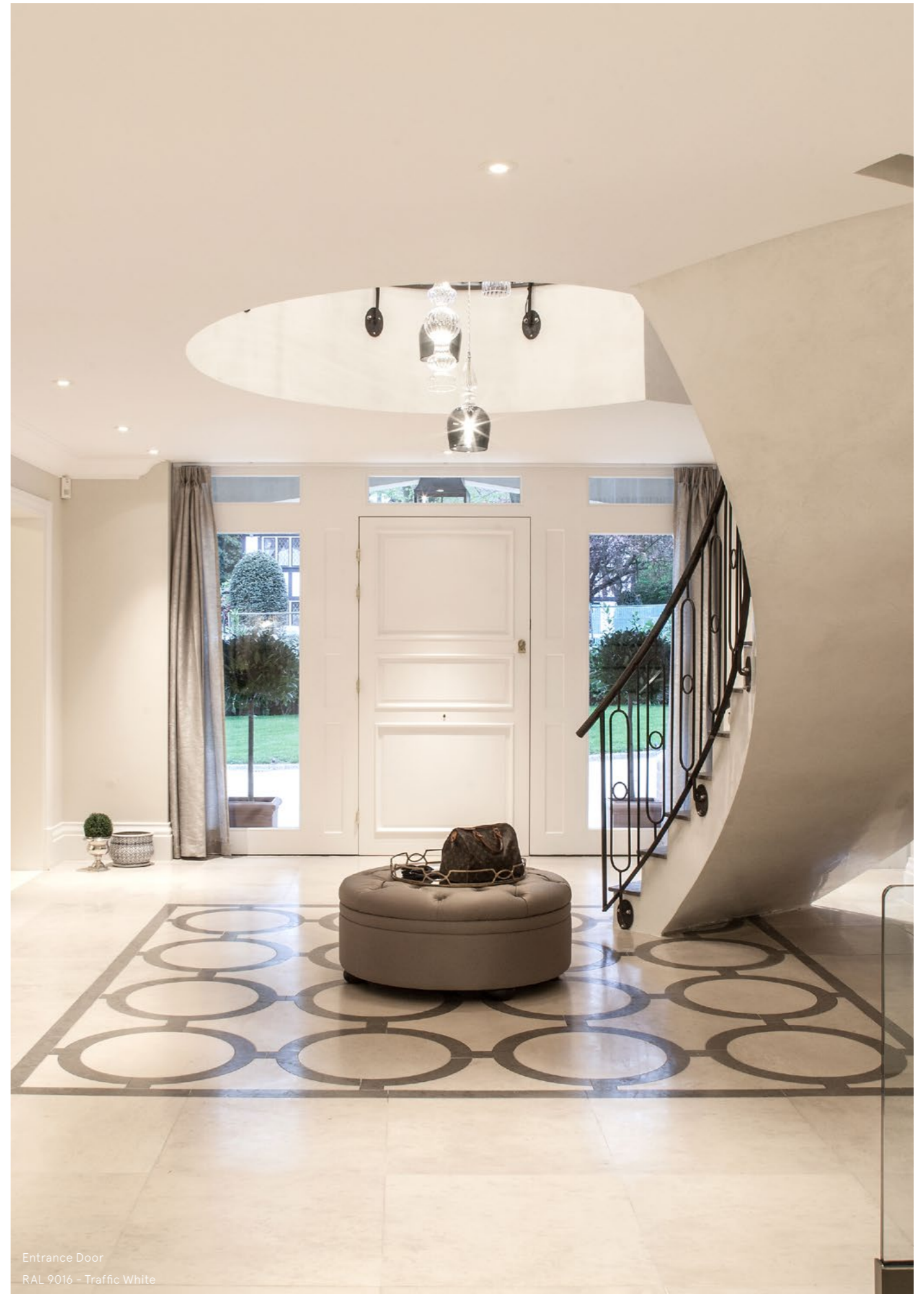
Entrance Door RAL 9016 - Traffic White