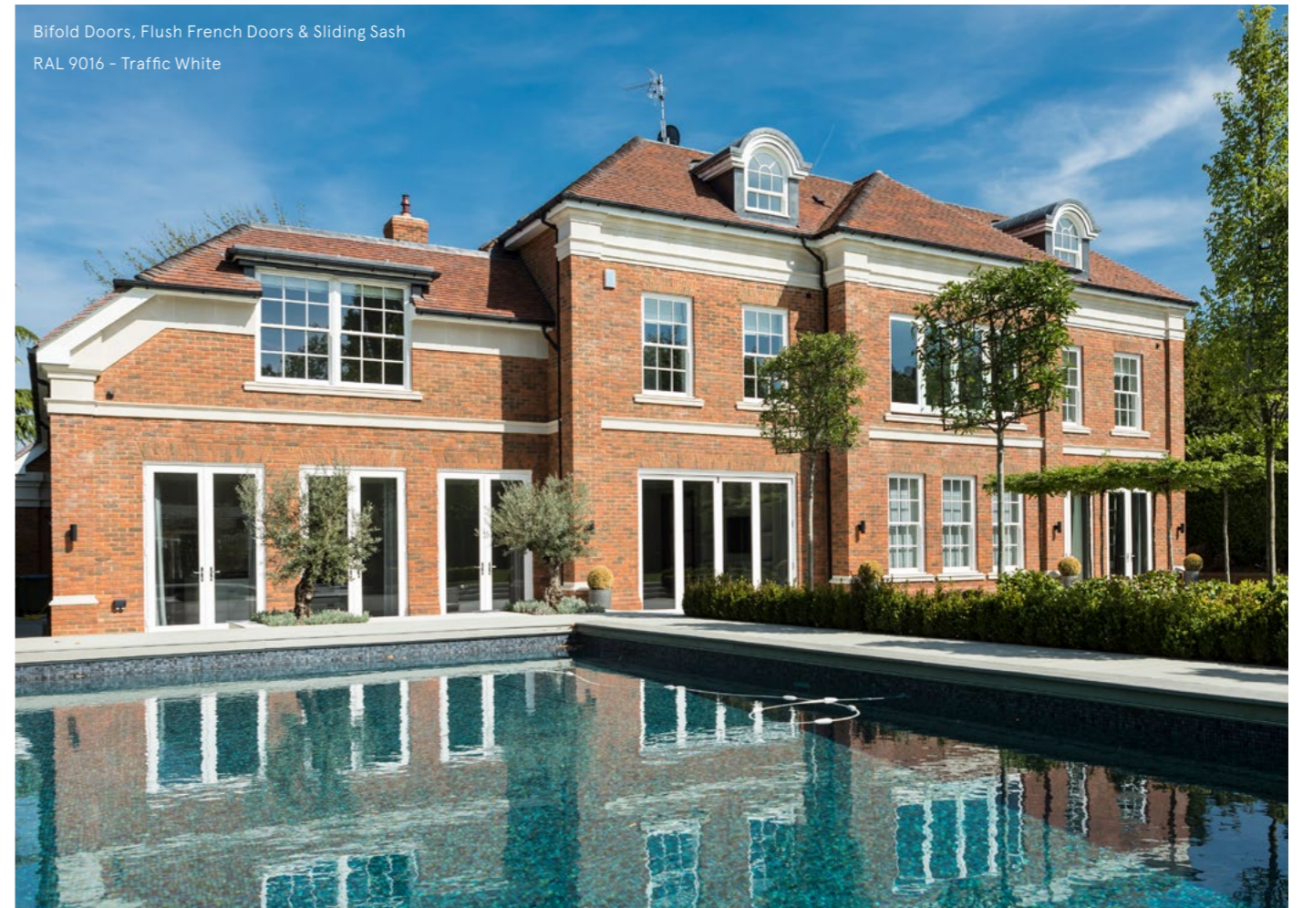
Bifold Doors, Flush French Doors & Sliding Sash RAL 9016 - Traffic White