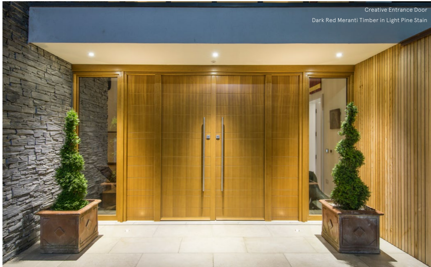
Creative Entrance Door Dark Red Meranti Timber in Light Pine Stain