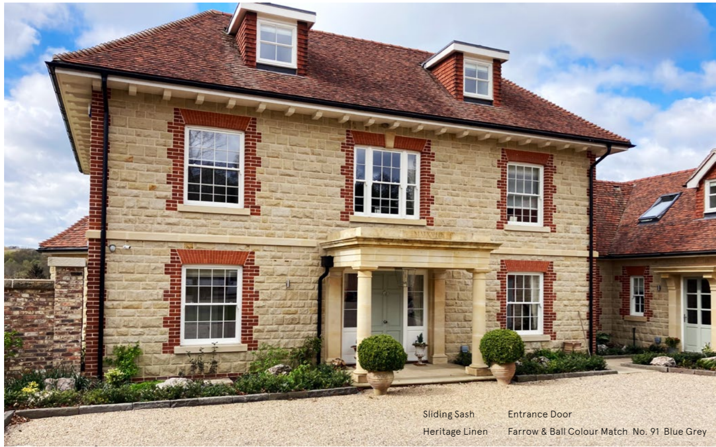
Sliding Sash Entrance Door Heritage Linen Farrow & Ball Colour Match No. 91 Blue Grey