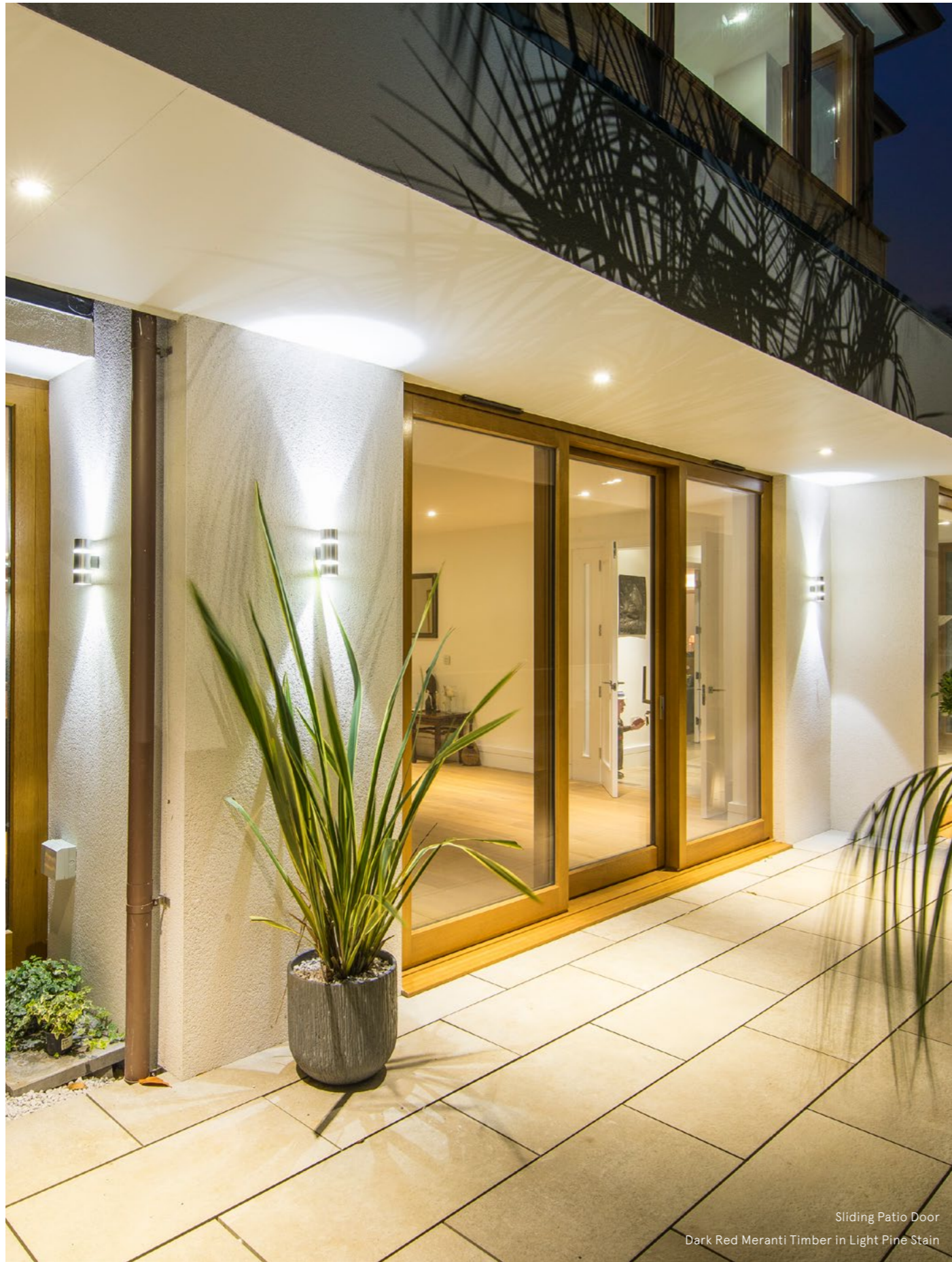
Sliding Patio Door Dark Red Meranti Timber in Light Pine Stain